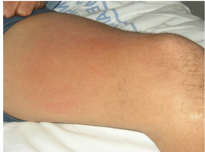
Figure 2 Skin Reaction patient in day #2.

Many algorithms of insulin allergy diagnosis have been published although diagnosis is merely based in compatible clinical history and skin test [4] since many diabetic patients can have positive skin test and serum antibodies without clinical symptoms. Switch to insulin analogs has markedly decreased the number of allergic episodes [22-27], since allergenicity of insulin have been proposed by chemical changes in the terminal of B chain [18], where insulin analogs have the modified structure. For instance, Lispro is insulin with lysine and proline in positions 28 and 29, respectively, of beta chain, instead of proline and lysine as in human insulin. Aspart has aspartate in position 28 of beta chain instead of proline (figure 4). Glargine is insulin with arginine and proline in positions 28 and 29 respectively. However, these analogs have also ability to induce allergic episodes [5,16-21,28] and reduced immunogenicity has been more associated to its faster absorption than any changes in the immunogenic epitopes [25].