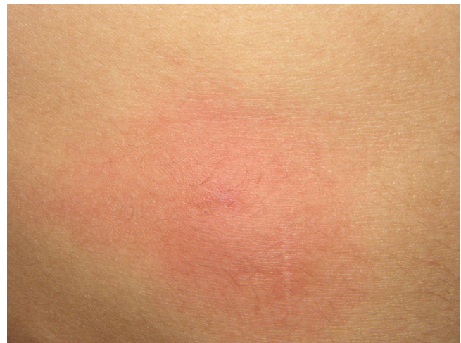
Figure 3 Skin Reaction patient in day #3.

In the near future, anti-immunoglobulin E treatment with omalizumab will probably give another alternative to these patients before transplantation [32]